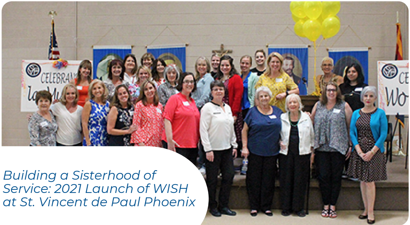
Building a Sisterhood of Service: 2021 Launch of WISH at St. Vincent de Paul Phoenix

St. Vincent de Paul Phoenix launched the first WISH initiative in 2021. As one of Arizona's largest and most influential human service charities, the organization connected a powerful sisterhood of philanthropy in service to the needs of their community. Their service model is intentionally inclusive, highly impactful, and qualitatively and quantitatively measurable.