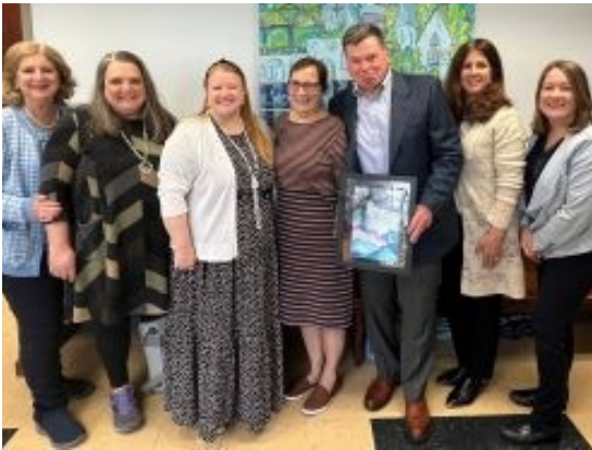
Founding Members of the St. Mary's Conference in Rome, Georgia.